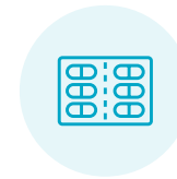
Drug safety & pharmacovigilance