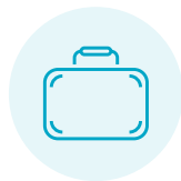
Board & leadership