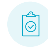
Procurement & supply chain