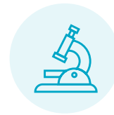
Research & development