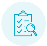
Medical governance & compliance