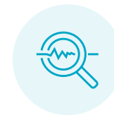
Biometrics & data management