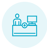
Operations & production